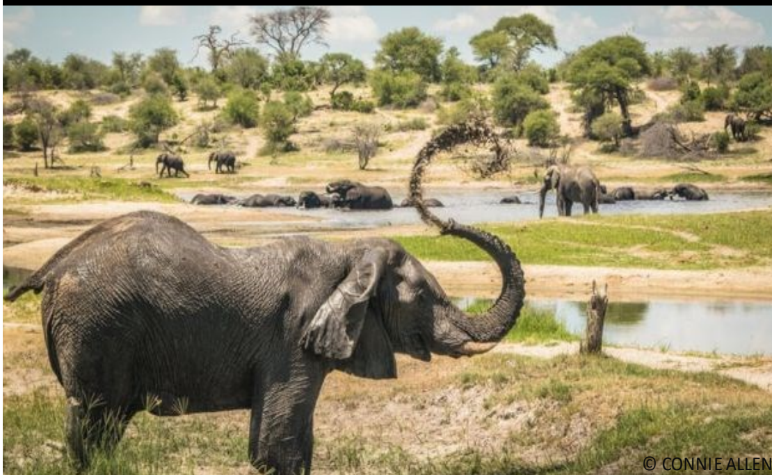
Male African elephants meet at the Boteti River, Makgadikgadi Pans National Park, Botswana.